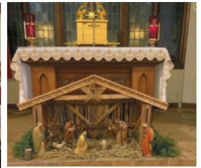
Nativity in Our Chapel