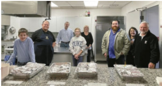
Our Lady of Guadalupe Taco Breakfast