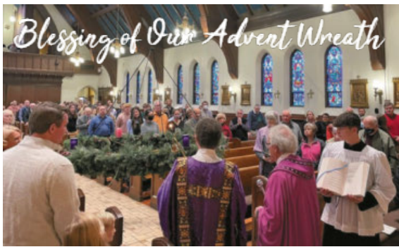
Blessing of Our Advent Wreath