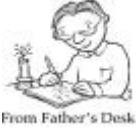
From Father's Desk