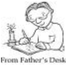
From Father's Desk