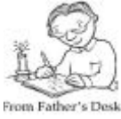
From Father's Desk