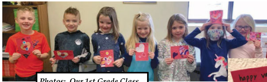
Photos: Our 1st Grade Class