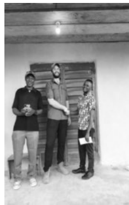
A Saving Send Off