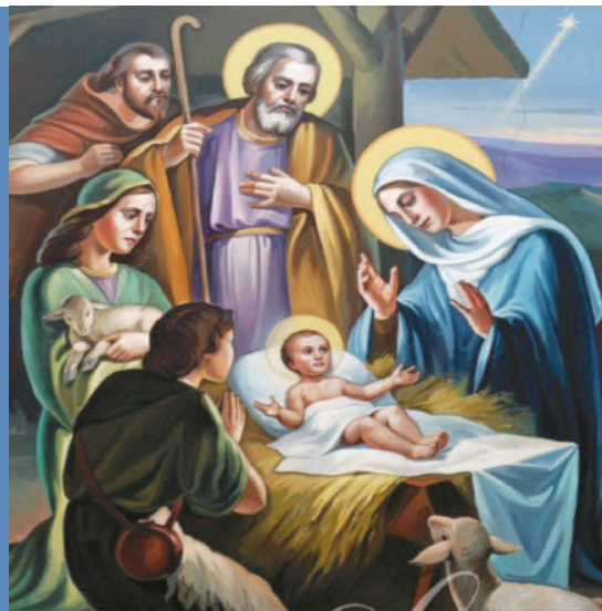
The Nativity of the Lord

Come to or call the parish office to register. 507-534-3321