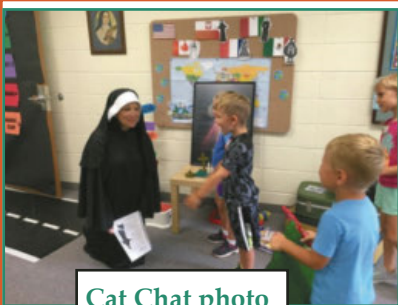
Cat Chat photo