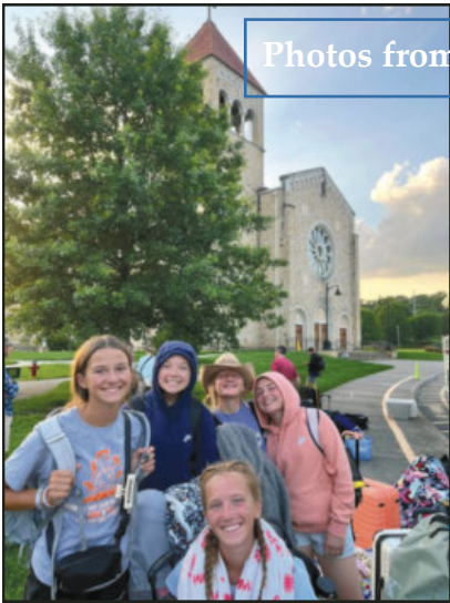
Photos from our 'Alive in You' Mission Trip to Knoxville, TN