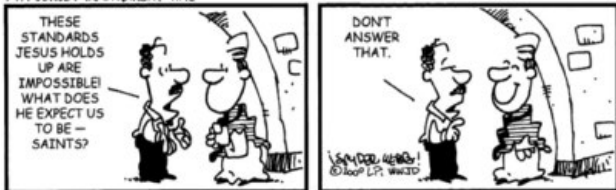
7TH SUNDAY IN ORDINARY TIME