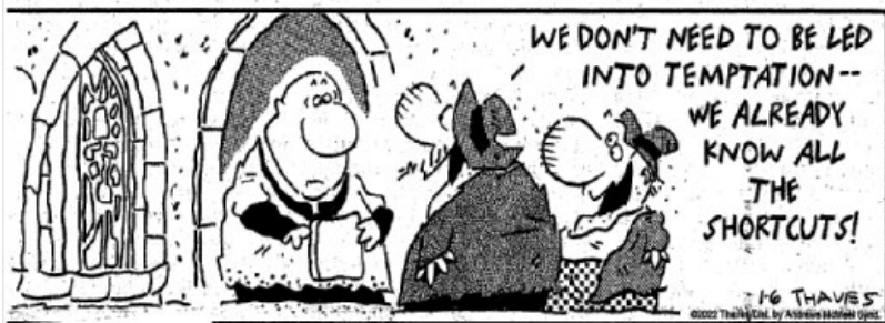
Frank & Ernest by Bob Thaves

A virtual bottle drive is available online at www.woodburymissionpartners.com/baby-bottle