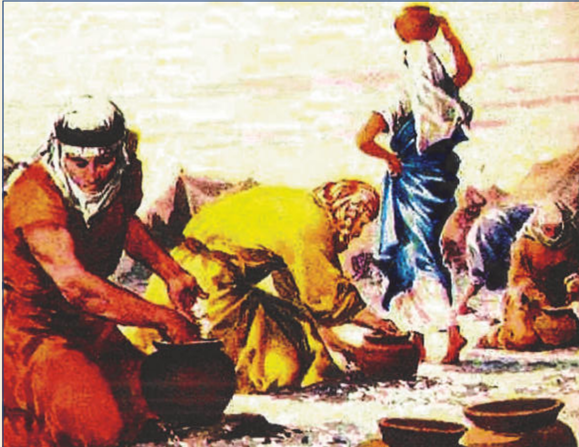
Manna in the wilderness

Summer Weekly Masses: Saturday 4:30 & Sunday 9:30 Sacrament of Reconciliation: Saturday 3:45