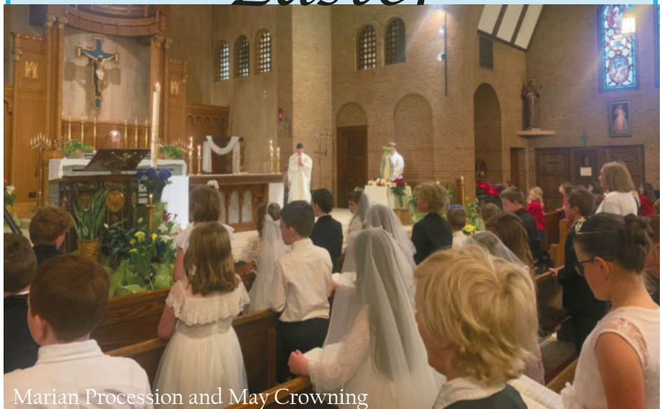
Marian Procession and May Crowning