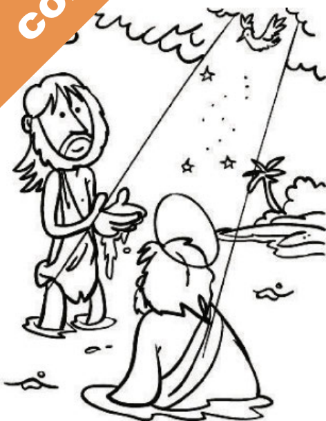
Baptism of the Lord • Luke 3:15-16, 21-22