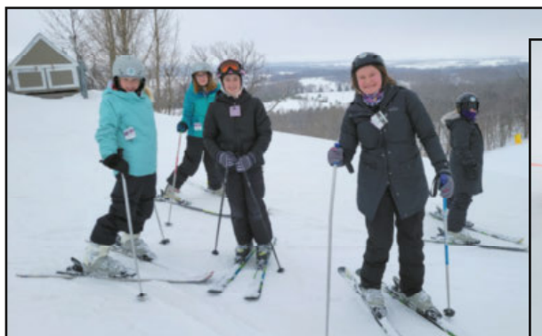
SMILES BEFORE HEADING DOWN THE SLOPE