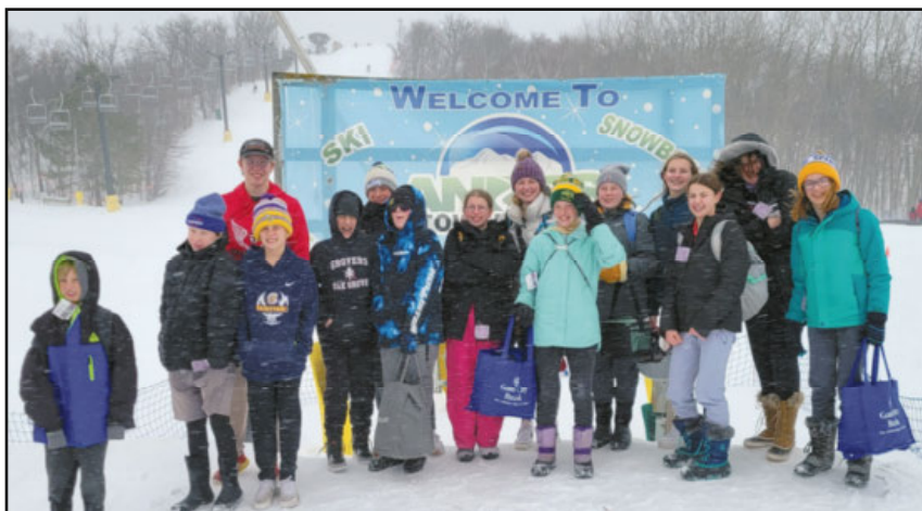
GROUP PHOTO OP!

On February 20, President's Day, 21 Holy Spirit kids joined others from the F-M Catholic Church community and enjoyed their day off from school skiing at Andes Tower Hills in Kensington, MN. The kids had a great time and came home with big smiles and spent energy. The two chaperones had as much fun and came home even more tired! Big Bonus... no injuries!