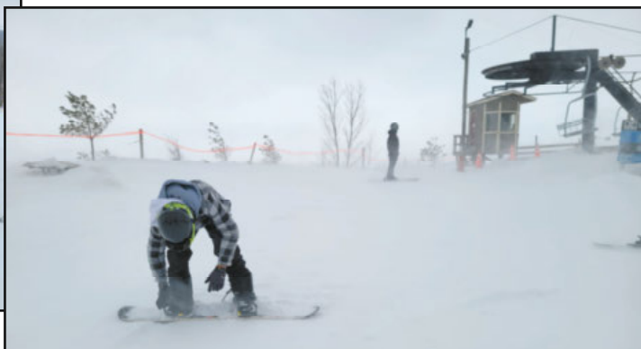
BINDINGS ALWAYS SEEM TO NEED ADJUSTING!