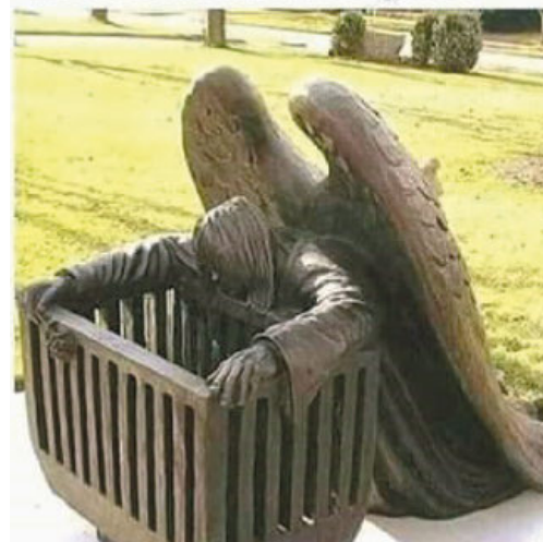
An Angel crying at the cradle of the aborted child he was to guard.

And now, back to the movie. The St. Bridget's Pro-life Youth Group cordially, no affectionately (Sound of Music), invites all parishioners to join us for a taco and sundae bar, this Sunday, May 15th, at 5:00 PM in the Conference Room for St. Bridget's premier showing of "God's Not Dead." Should massive crowds respond, we will move to the Social Hall. The movie will last an hour and 53 minutes, but because we are not RSVPing, the taco and sundae bar will last as long as supplies do.