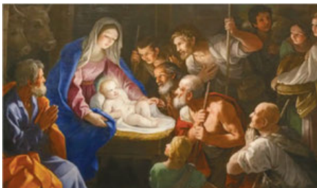
Guido Reni (1640)