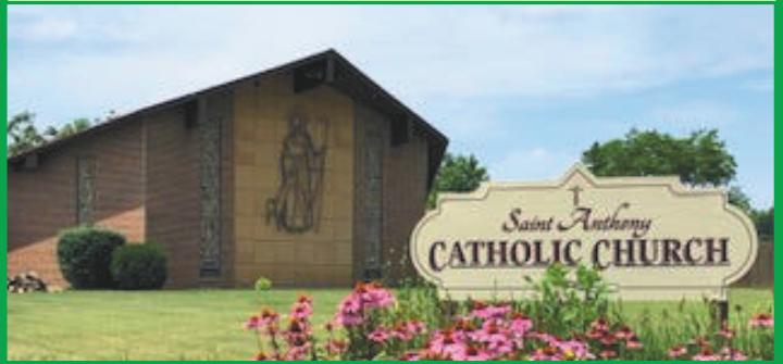
St. Anthony, Knoxville