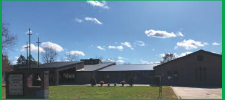
Sacred Heart, Melcher