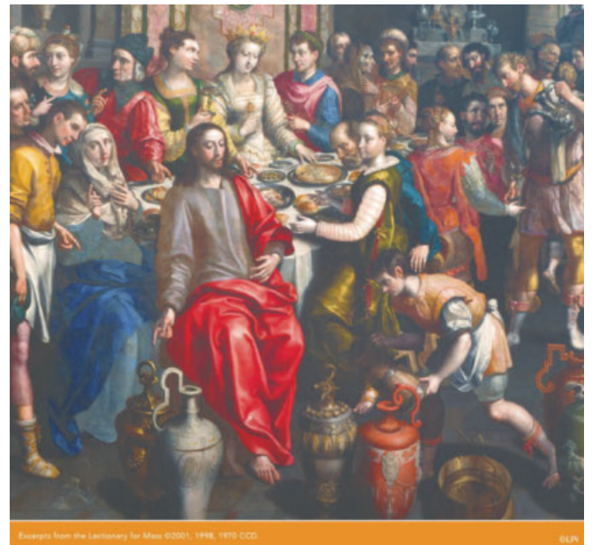
Excerpts from the Lectionary for Mass ©2001, 1988, 1970, ©202