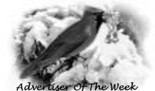
Advertiser Of The Week

Knights of Columbus, Chisholm, Council #3539, C/O St. Joseph's Catholic Church, 113 SW 4th Street, Chisholm, MN. 55719.