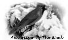
Advertiser of the Week

Donations can be made to: Knights of Columbus, Chisholm, Council #3539, C/O St. Joseph's Catholic Church, 113 SW 4th Street, Chisholm, MN. 55719