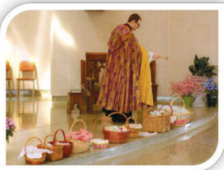
The blessing of food on Holy Saturday for the first meal of Easter.