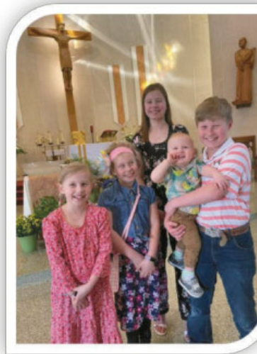
Dahl family Easter photo