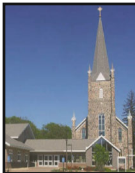
ST. MARY HELP OF CHRISTIANS