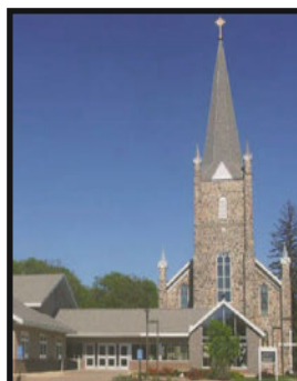
ST. MARY HELP OF CHRISTIANS