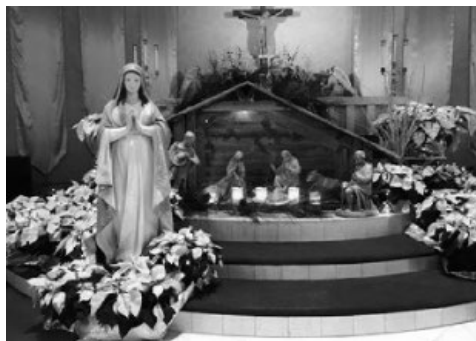
The Christmas creche at St. Cecilia, 2018

my elbows resting on the top of the rail, and being brought into the Christmas story. And I remember the smell, of the evergreen and the straw. It wasn't a mystical experience, just an ordinary experience of the Silent Night, and I'm resting with my arms on the altar rail, watching it—at eye level, believing. I was alone in the church too, but unafraid.