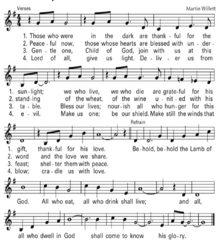
Text: Refrain based on John 1:29. Text and music © 1984, OCP. All rights reserved.