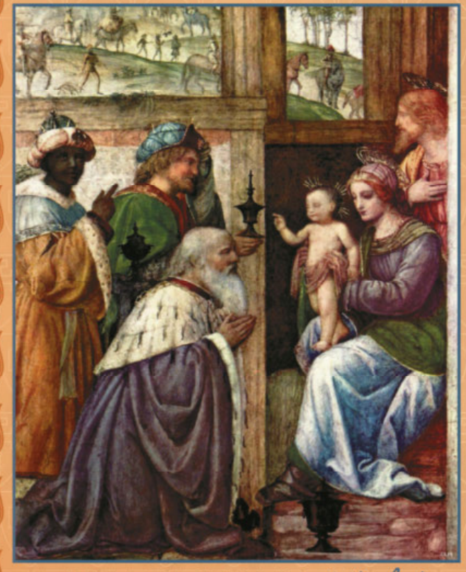
THE EPIPHANY of the Lord "Since from you shall come a ruler, who is to shepherd my people Israel." -M.256

Please contact a funeral home. They will notify the parish.