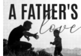
A Prayer for Fathers

Sheets with our prayer list and a synopsis of the Sunday readings are available in the bulletin stand on the counter in the narthex.