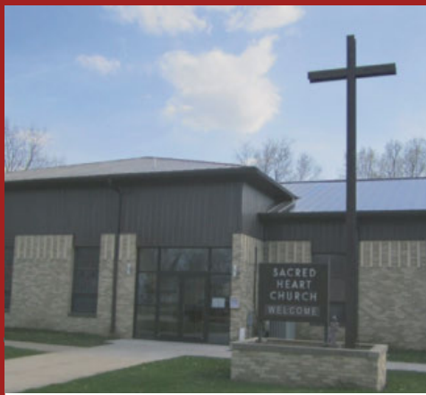
SACRED HEART 1021 Poplar Street La Porte City, IA 50651