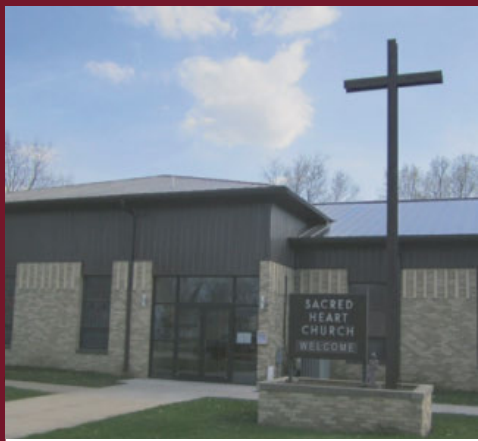
SACRED HEART 1021 Poplar Street La Porte City, IA 50651