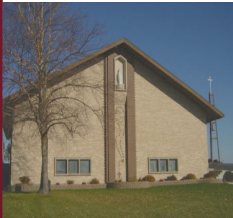
ST. MARY OF MT. CARMEL 1435 E. Eagle Road Waterloo, IA 50701