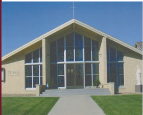
ST. PAUL 1102 Walnut Street Traer, IA 50675