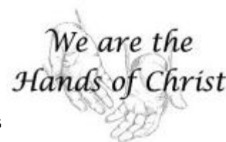
BAPTISM OF THE LORD

Today we celebrate the Baptism of the Lord. The U.S. Bishops' Pastoral on stewardship reminds us that Baptism gives all of His disciples a share in His priestly work and calls them "to offer up the world and all that is in it — especially themselves — to the Lord of all"