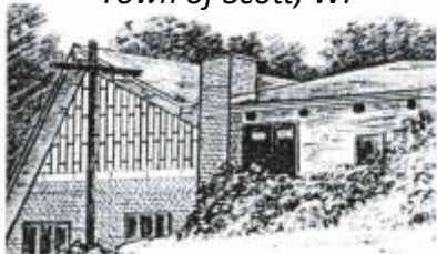
Sacred Hearts of Jesus and Mary Town of Scott, WI