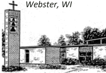
St. John the Baptist Webster, WI