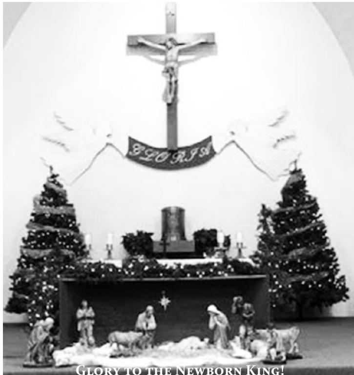
GLORY TO THE NEWBORN KING! THANK YOU for all those who helped preparing the Christmas Nativity!