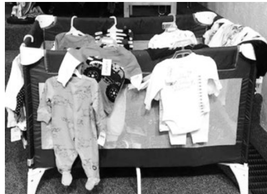
A special THANK YOU to those who donated items for the Advent Baby Shower!