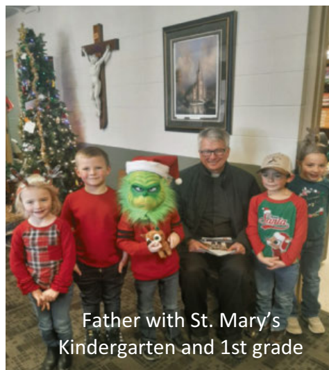
Father with St. Mary's Kindergarten and 1st grade