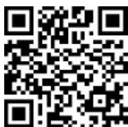
Our Lady of Fatima