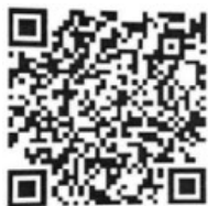
St. Joseph's Church