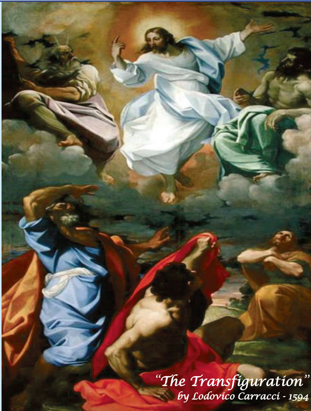
"The Transfiguration" by Lodovico Carracci - 1594