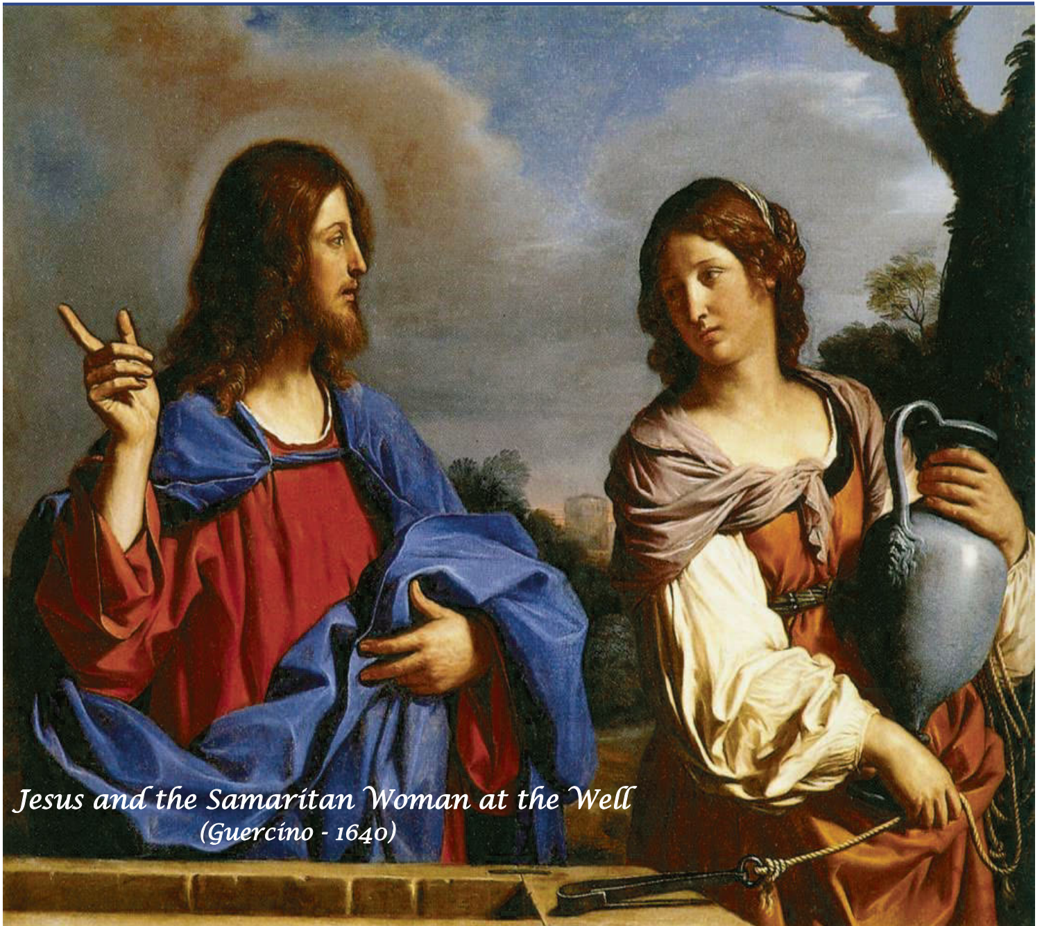
Jesus and the Samaritan Woman at the Well (Guercino - 1640)