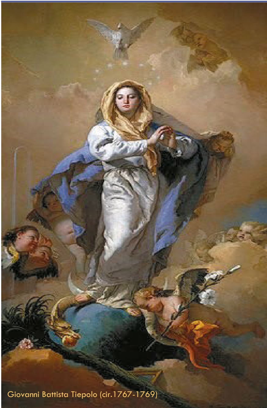
Giovanni Battista Tiepolo (cir.1767-1769)