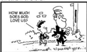
6th SUNDAY OF EASTER

Also, please check out the Vocations website for information about JPII Camp for Boys and Goretti Camp for Girls . https://www.sfcatholic.org/vocations