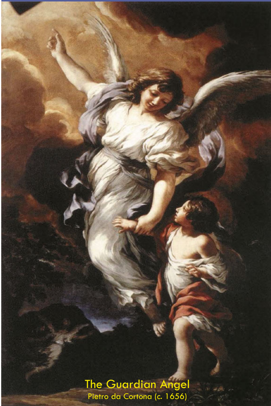
The Guardian Angel Pietro da Cortona (c. 1656)