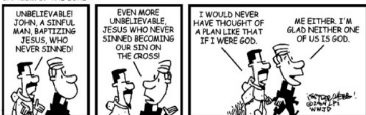
BAPTISM OF THE LORD

Held Grief Series - Through Grief By Grace presented by the Lourdes Center. This 8-week Grief Series will begin Tuesday, February 4, 2025 from 6:00pm-8:00pm. The series will blend education and faith surrounding the loss of a loved one through death. Each session will allow for small group discussion according to your particular loss (loss of a child, spouse, parent/sibling). Registration is required. Free will donations accepted. Register at www.thelourdescenter.com .