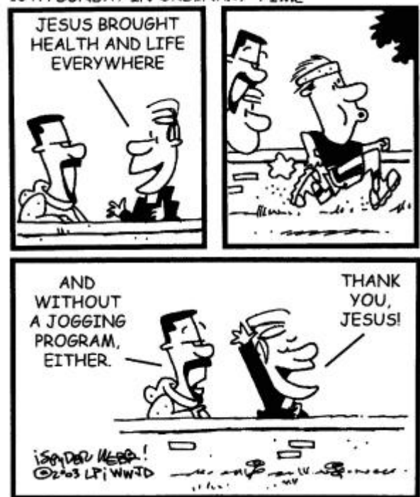
13TH SUNDAY IN ORDINARY TIME