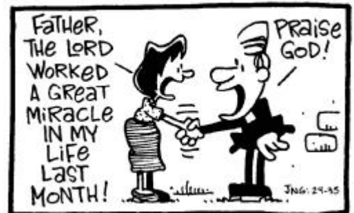
18 th SUNDAY IN ORDINARY TIME