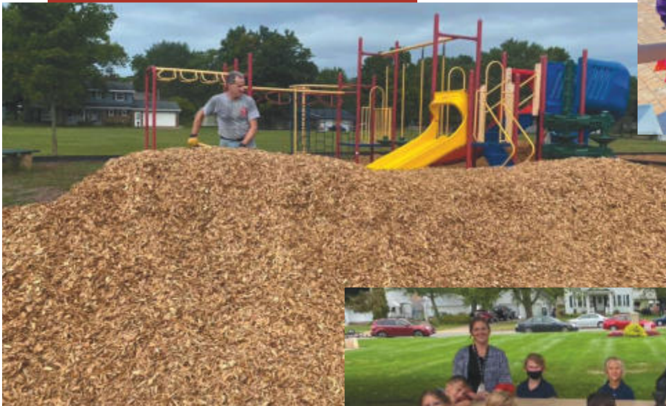
heaps of mulch spread across school playground by 4 volunteers .