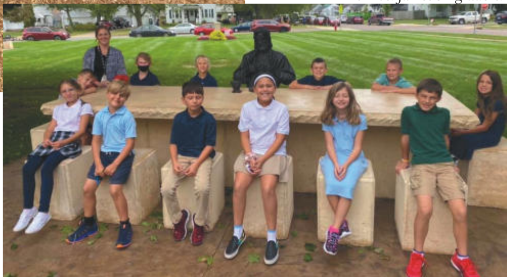
Happy first day of school from St. James 3 rd graders!