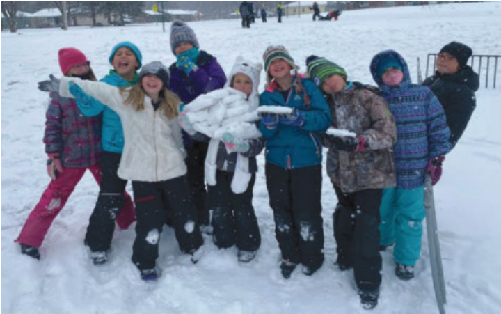
St. James Elementary School kids enjoying the snow!