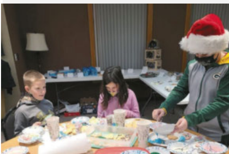
Cookie decorating party!