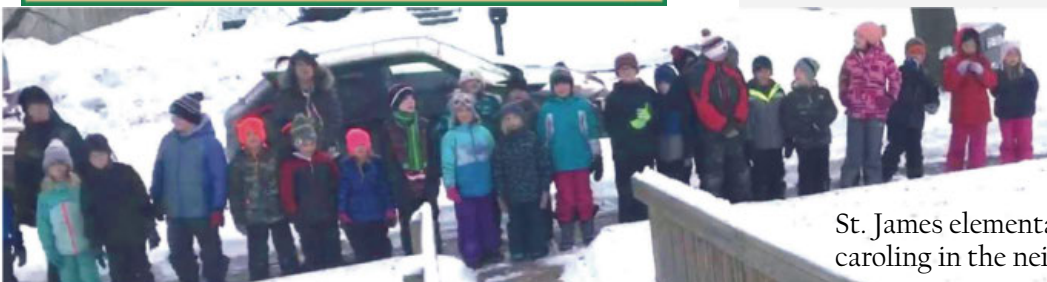
St. James elementary school kids caroling in the neighborhood