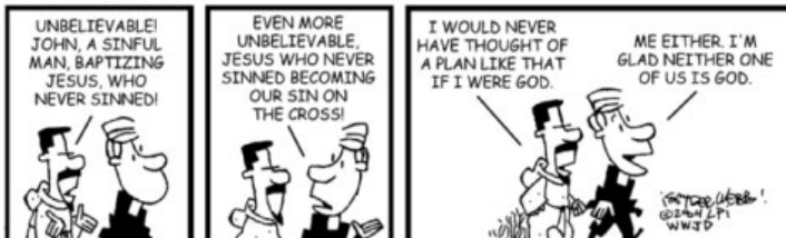
BAPTISM OF THE LORD