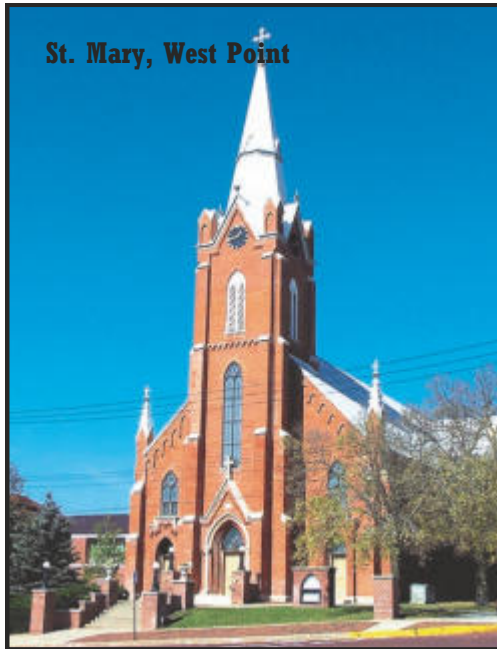
St. Mary, West Point