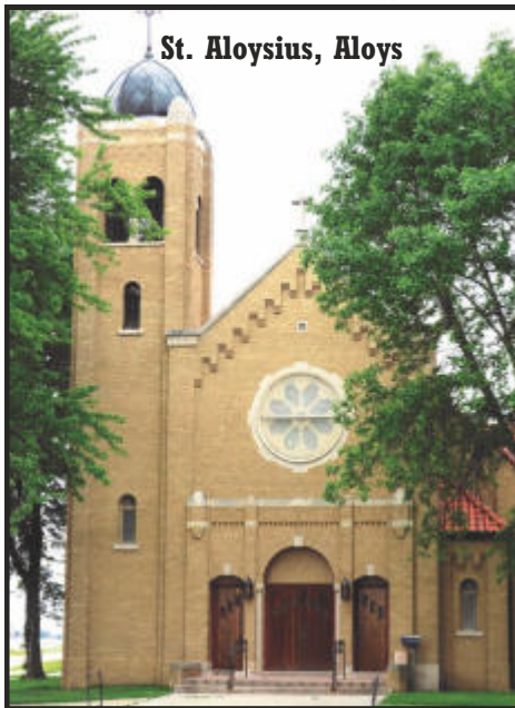
St. Aloysius, Aloys