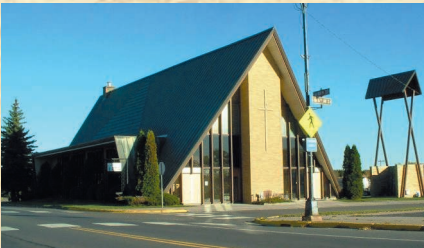
Biwabik 600 South Main Street Biwabik, MN 55708 218-229-3210