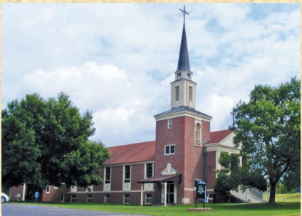
Hoyt Lakes 319 Kennedy Memorial Drive Hoyt Lakes, MN 55750 218-229-3210