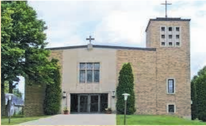
Aurora Main Office 16 West 5th Avenue N. Aurora, MN 55705 218-229-3210