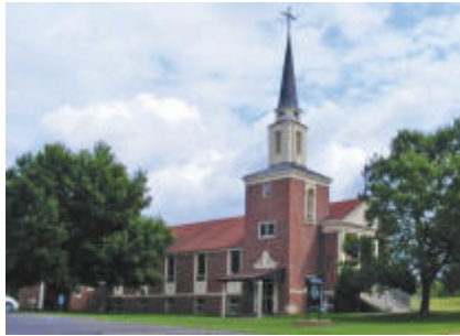
Hoyt Lakes 319 Kennedy Memorial Drive Hoyt Lakes, MN 55750 218-229-3210