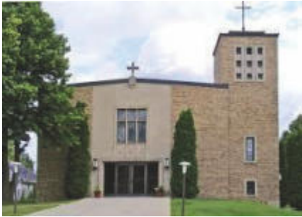
Aurora Main Office 16 West 5th Avenue N. Aurora, MN 55705 218-229-3210