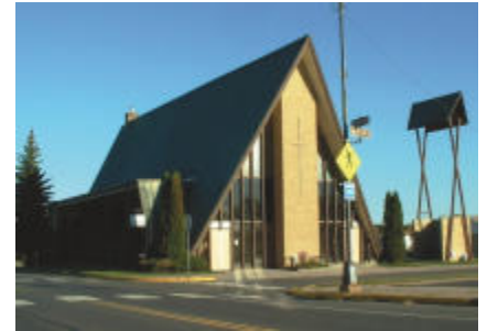
Biwabik 600 South Main Street Biwabik, MN 55708