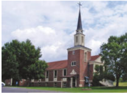
Hoyt Lakes 319 Kennedy Memorial Drive Hoyt Lakes, MN 55750 218-229-3210